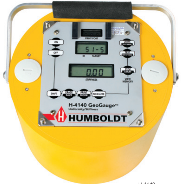
H-4140 Face Detail